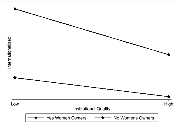
Fig 3. Interaction of institutional quality and female owner